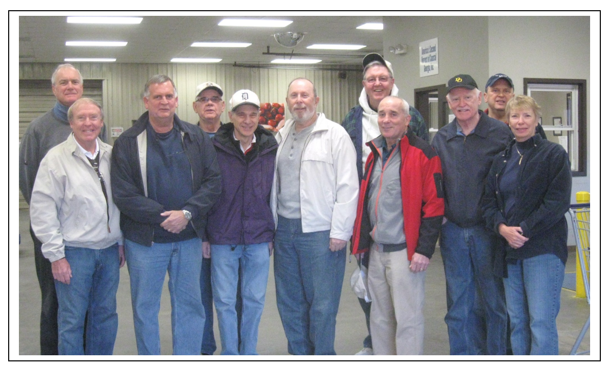
11 Kiwanis volunteers worked on Sat. Jan 10, 2011 packing food boxes for America's Second harvest.