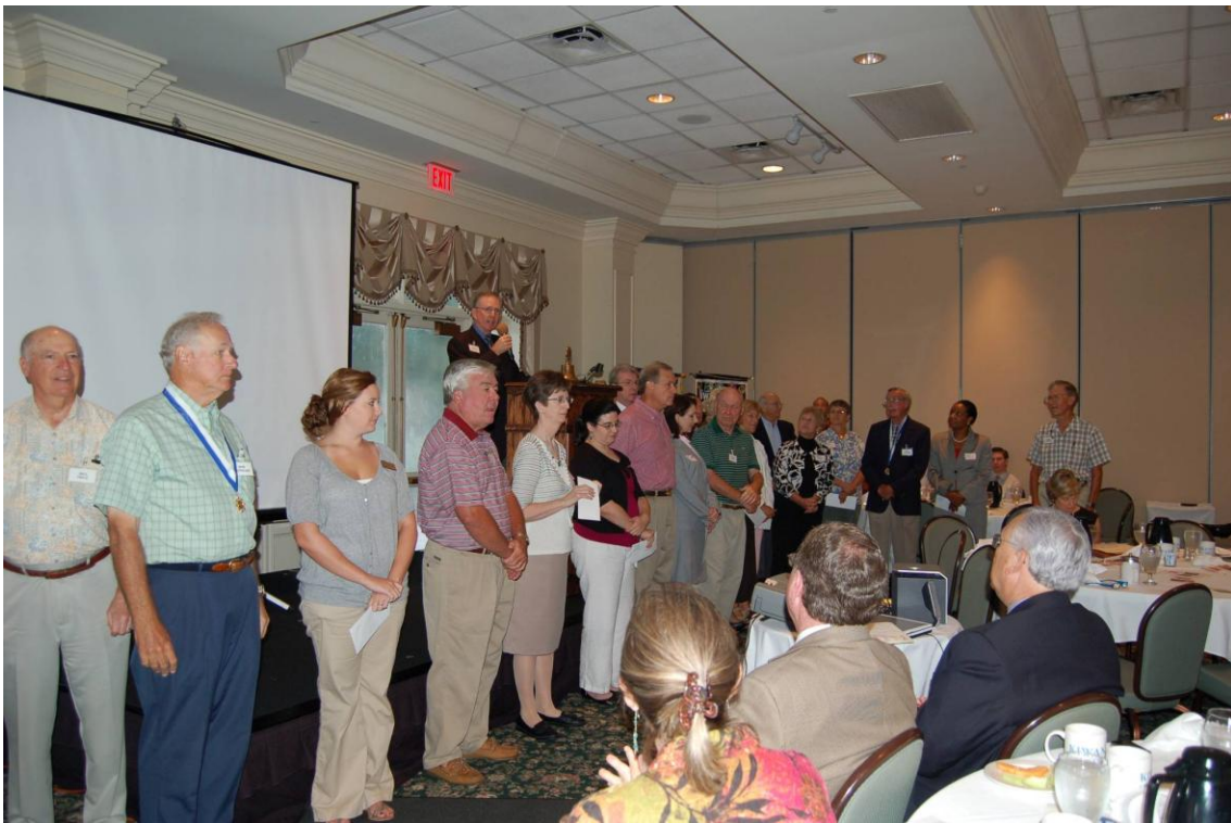
Community Service Groups Recognized by Kiwanis of Skidaway