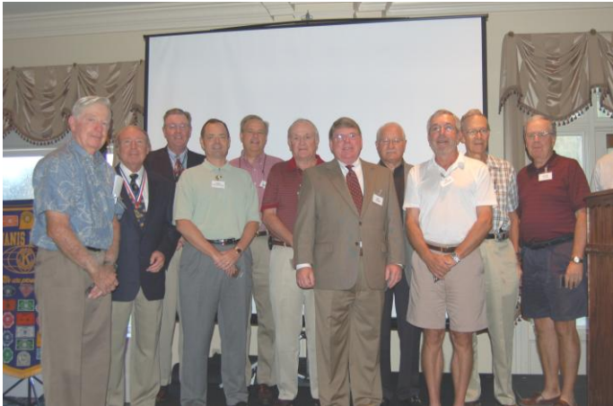
Kiwanis directors and community leaders