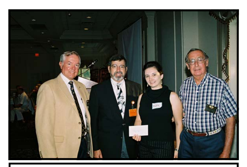
PEDRICATE ONCOLOGY SURIVORS SUPPORT ENDEAVER