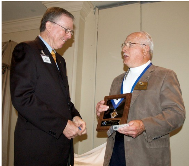
Our Distinguished Secretaries