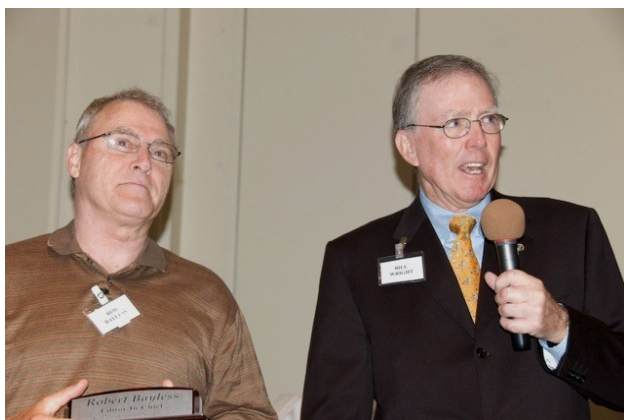
Your Editor-in-Chief of the Kiwanigram -11-16