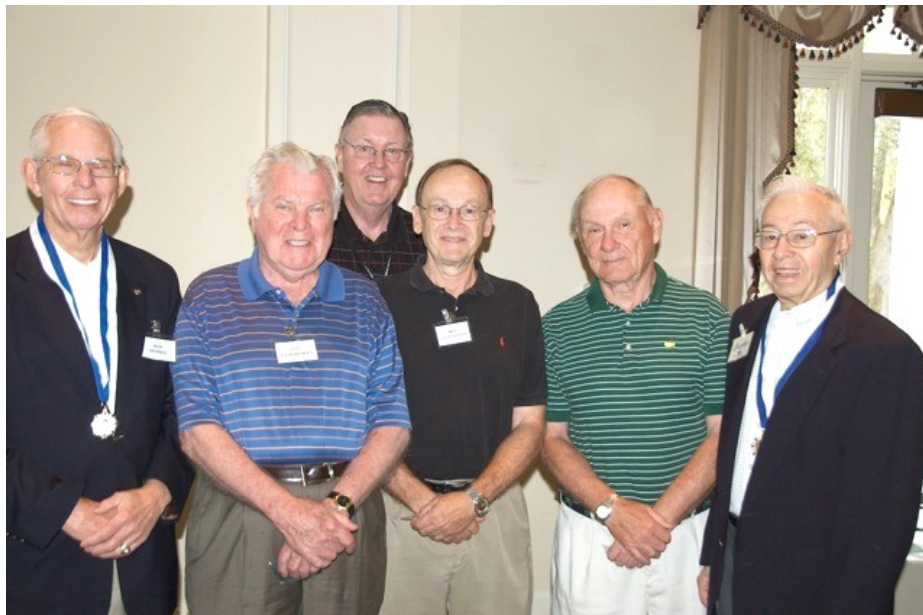
“You Hold the Key” Award Winners