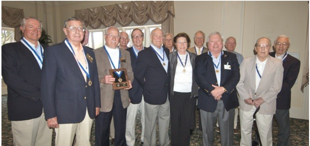
Our Hixson Fellows