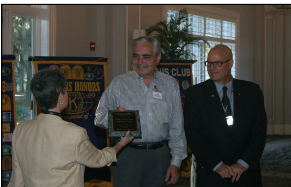
Counter-clockwise from middle left: