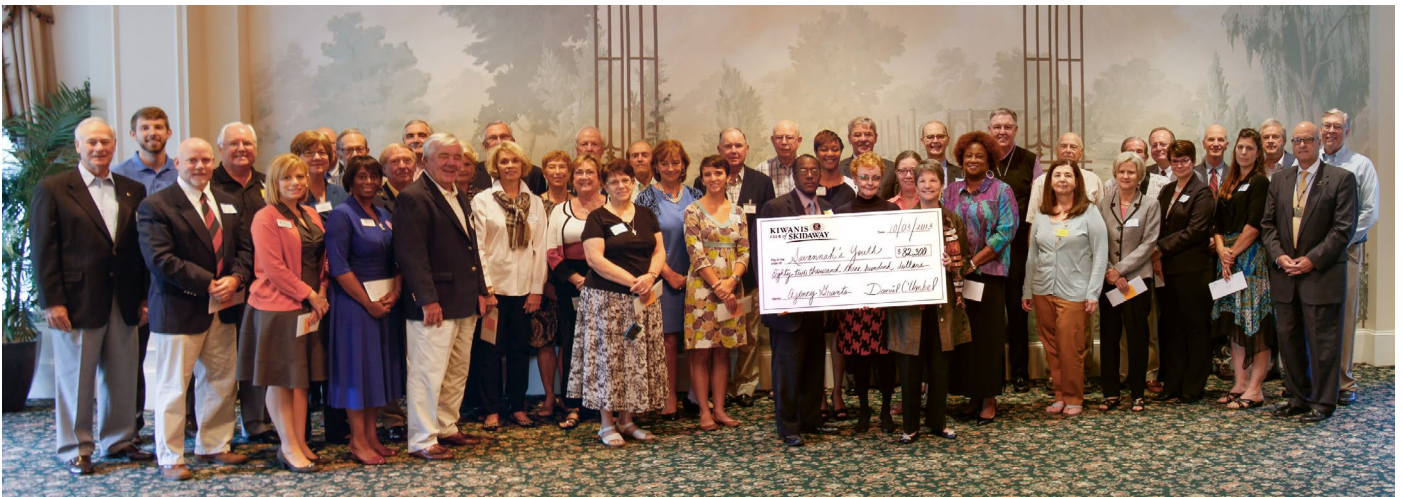
Photo of local agency representatives, together with their Kiwanis Club of Skidaway agency liaisons.

Dollars for Doers Awards. In addition, our club made six $300 grants, aggregating $1,800, through our Dollars for Doers program during 2012-2013 to the following agencies: Agudath Achim Synagogue (for their Backpack Buddy program), Coastal Conservation Association of Skidaway (for the Kids' Fishing Derby), Crohns and Colitis Foundation (for Camp Oasis), SAFE Shelter, Special Pops Tennis of Savannah, and The Salvation Army.