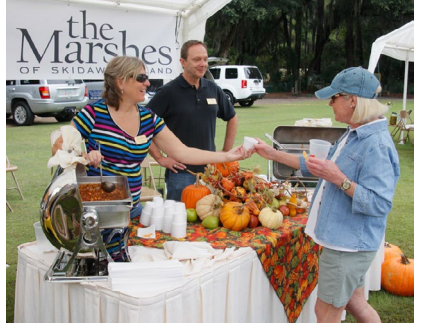
Thanks to all our competitors for helping to help Savannah's at-risk children!