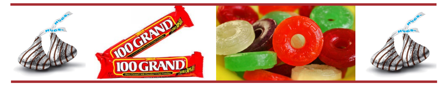
Image credits: Hershey hugs (Amazon.com), 100 Grand bar (candy.org), Lifesavers (ohio.com)