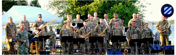
Left Above: Special Olympics Bowling; Left Middle: Salvation Army Bell Ringers; Left Bottom: Junior Achievement Right Above: Army Bands from our 2016 Concert on the Green at Landings Harbor; Right Below: Weekly Meeting Memories