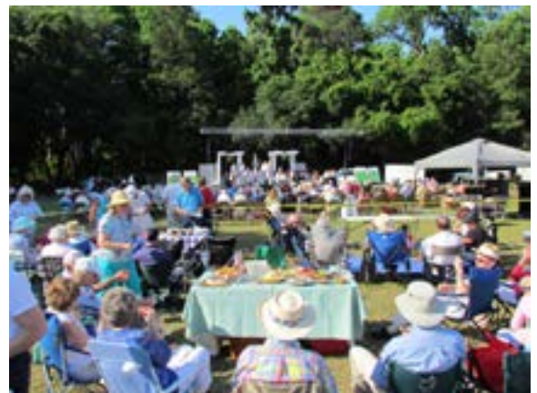
Scene from the 2013 Concert on the Green