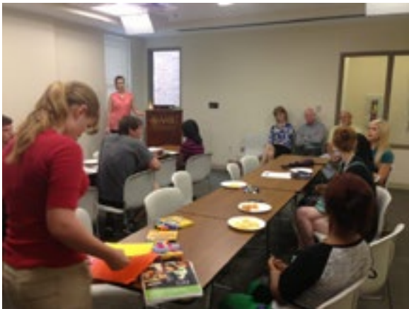
Below: Photo-op for all attendees