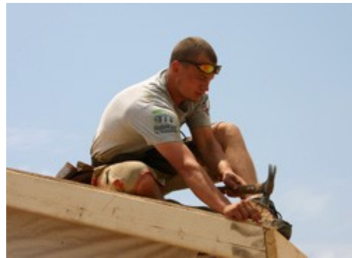
Habitat AmeriCorps member building in the Mississippi Gulf Coast.

This summer, June 14–20, more than 500 Habitat for Humanity AmeriCorps members and alumni will help 20 families build houses in the community hardest hit by the Iowa floods of 2008.