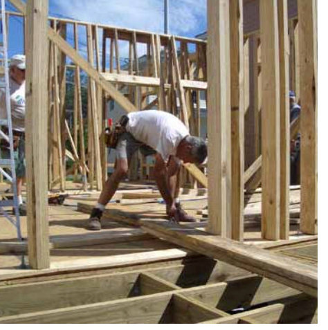
The house lies two short blocks to the east of Abercorn.