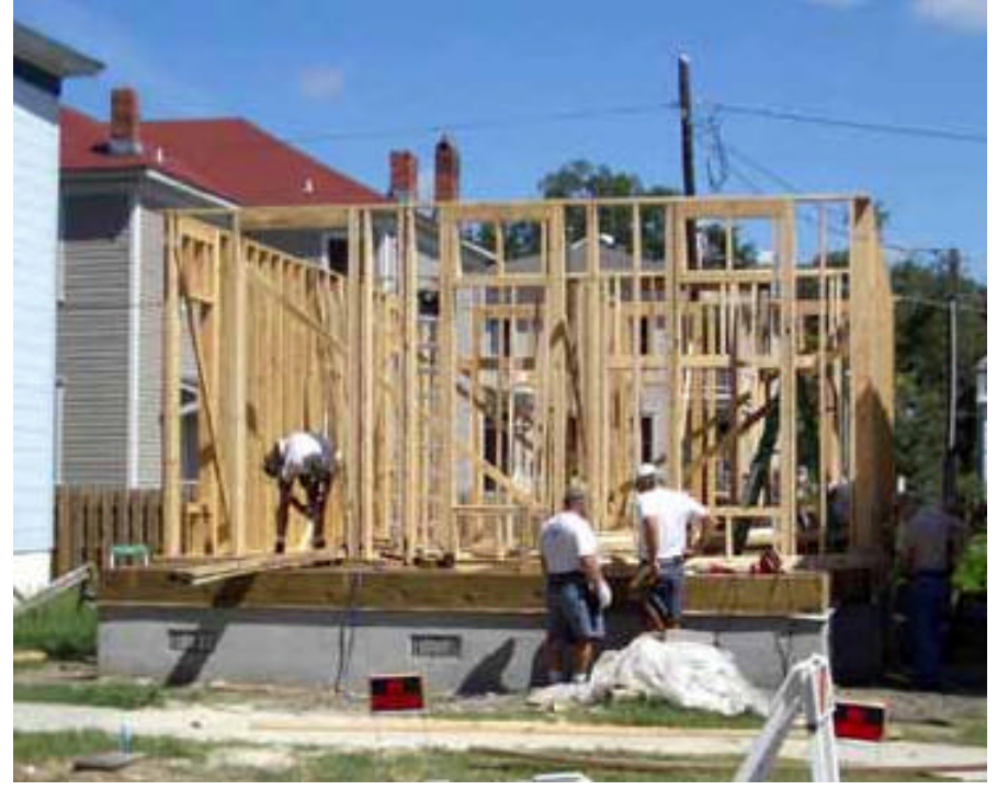
September 12 - Front view looking north. No hint yet of second story. Nor of a roof over the front porch.