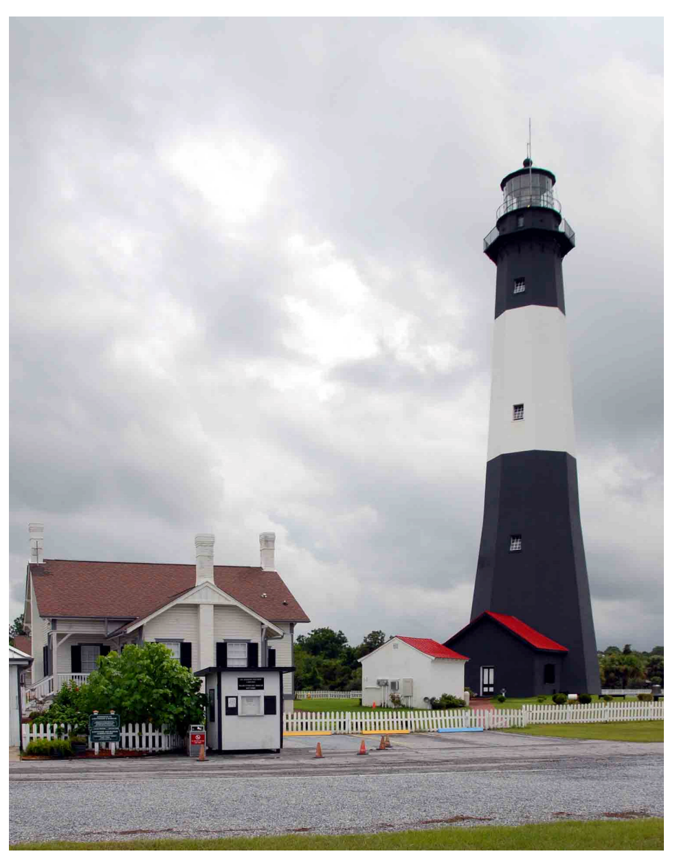
What may be Chatham County's most famous landmark, the light house station on Tybee Island has been guiding mariners to a safe arrival in the Savannah River for over 270 years. This photo was taken on a mostly rainy Saturday afternoon in early September. The clouds did not exactly part for the photographer, but the downpour eased enough to let him out of the car to take this photo. A little darkroom tweaking also helped.

This could very easily be one of your photos. See page 6.